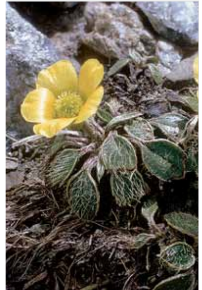
Feldmark buttercup - distinctive hairy leaves to help prevent heat and water loss.