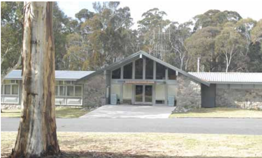
Kosciuszko Education Centre Sawpit Creek