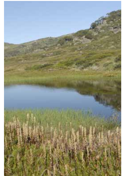
Sub-Alpine fen and frost hollow near Spencers Creek