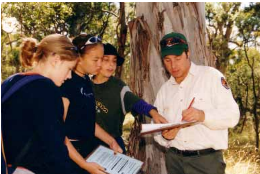
Going Up the Mountain is an engaging and active day in the national park