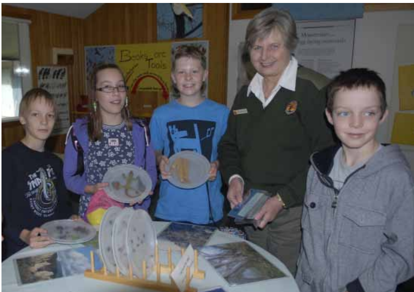
The 'Kosciarium Dinner Party' one of over 40 hands on activities and games in the Kosciarium