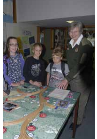
'What Rat is That' the dichotomous key traintrack in the Kosciarium